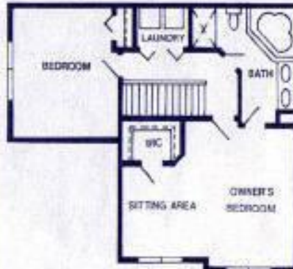
OPTIONAL 2ND FLOOR