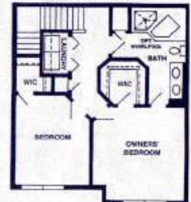
OPTIONAL 2ND FLOOR