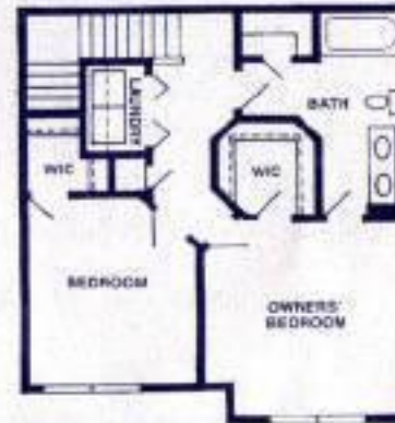
STANDARD 2ND FLOOR