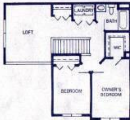
STANDARD 2ND FLOOR